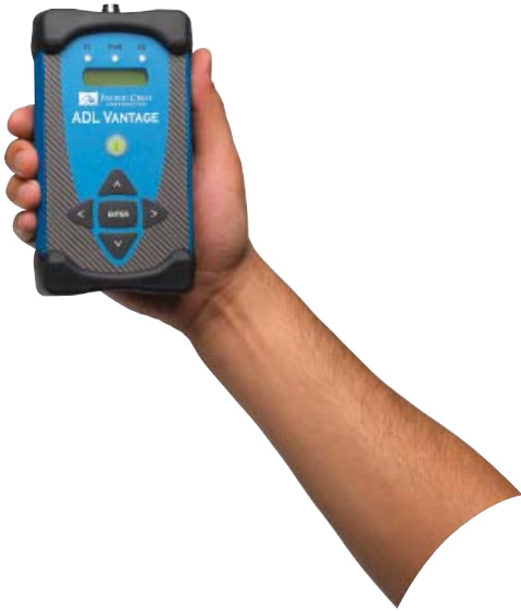
ADL Vantage Compact and Easy to Use